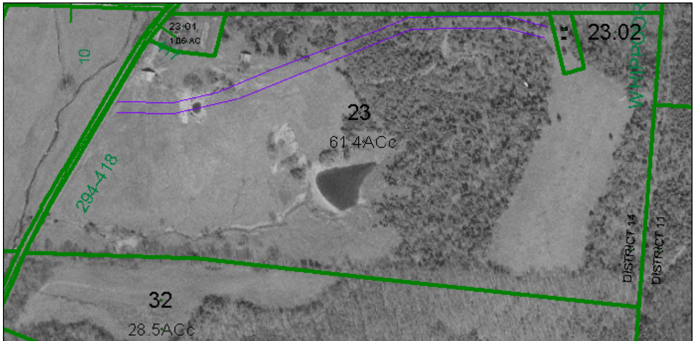
Tax Plat With Aerial View